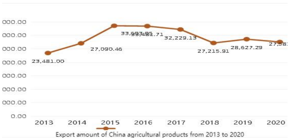
Fig. 2 Export amount of China agricultural products from 2013 to 2020 (Unit: USD 100 million)