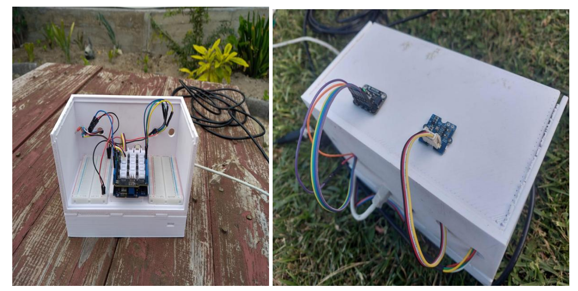
Figure 2: Showing the 3-D Casing design

seamless wireless connectivity. With this configuration, the sensor box becomes remotely accessible, enabling real-time monitoring and control. To ensure autonomy and flexibility, the sensor box incorporates a battery to power the probes. This design choice allows the system to operate independently of external power sources, contributing to its versatility and suitability for deployment in various agricultural settings. By combining 3D printing technology for protective housing, Arduino Uno WiFi Rev2 for wireless communication, and a battery-powered setup for autonomy, the proposed sensor box stands as a robust and efficient solution for small-scale farmers. This integrated approach ensures not only the security and durability of the hardware but also the practicality of remote monitoring and control.