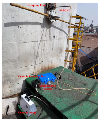
Figure 2 In Situ Deployment of Plug-And Play Sampling Probes at Multi-Port SCR Monitoring Locations

Figure 2 shows the field-deployed sampling setup used in the coal-fired power plant industrial environment. The vacuum pump operated at a flow rate of 10 L/min. The vacuum sampling box, with a total volume of 2 L, was connected to the vacuum inlet of the pump on its left side and to the sampler on its right side. A sampling bag was placed inside the box. The sampler is a steel tube approximately 2.5 meters in length, with a wall thickness of 2 mm and an outer diameter of 10 mm. One end of the steel tube was inserted into the sampling hole, while the other end was connected to the exterior of the vacuum sampling box.